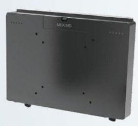
• Windows Box Module

Intel® N97 (6M Cache, up to 3.60 GHz) Intel® Core™ i3-1215U(10M Cache, up to 4.40 GHz) Intel® Core™ i5-1235U(12M Cache, up to 4.40 GHz)