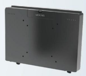
• Touch Monitor Box Module

RK3568 4 x Cortex-A55 up to 2.0GHz, Android 11.0 RK3588 4 x Cortex-A76 + 4 x Cortex-A55 up to 2.2GHz, Android 12.0 RK3576 4 x Cortex-A72 + 4 x Cortex-A53 up to 2.2GHz, Android 14.0