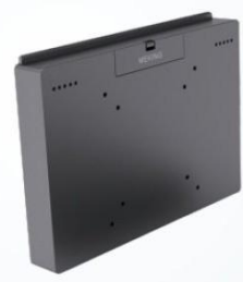
• Android Box Module

Intel® N97 (6M Cache, up to 3.60 GHz) Intel® Core™ i3-1215U(10M Cache, up to 4.40 GHz) Intel® Core™ i5-1235U(12M Cache, up to 4.40 GHz)